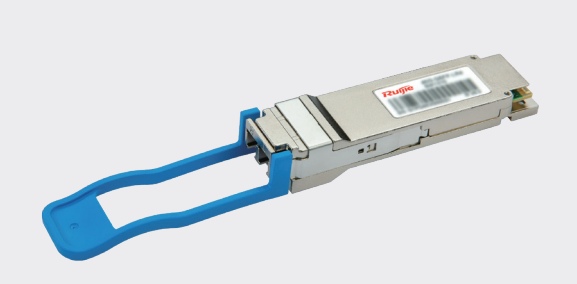
Appearance of 40G Module